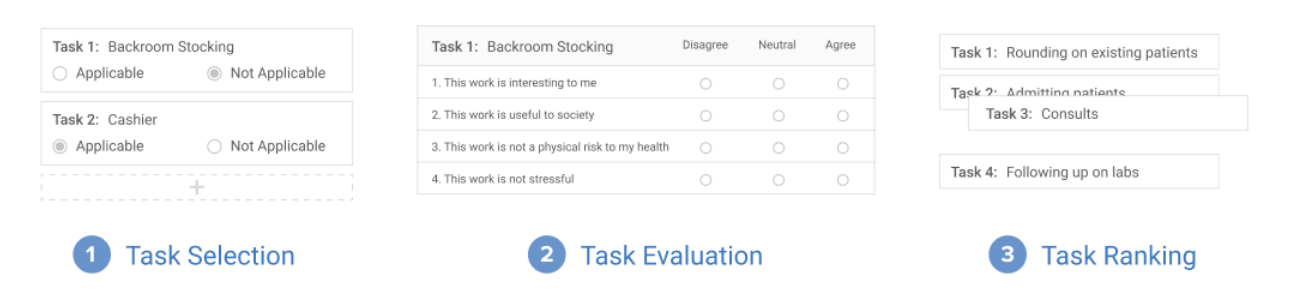
Figure 1: Ranking-based elicitation for task preference model . (1) The worker selects relevant tasks. (2) The worker provides inputs on their evaluations for each task. (3) The worker ranks the tasks according to their preferences.

dered by physical limitations and experiences of bodily pain, and biological health indicators" (Capio, Sit, and Abernethy 2014). The same tasks or work conditions can impact workers' physical well-being differently. For example, tasks that involve frequent social interaction or varying degrees of physical strength could be acceptable or even enjoyable for certain workers, but cause stress for workers who are introverted or physically weak. Another dimension of worker well-being is work-life balance (Guest 2002; PAI 2020), as work can hinder workers' abilities to carry out social roles outside of work. This is particularly relevant to shift scheduling and work hours. Shift work, particularly in the service industry, used to primarily employ younger adults with more schedule flexibility; however, the age range of shift workers has expanded in recent years, resulting in shift workers who need to handle family obligations.